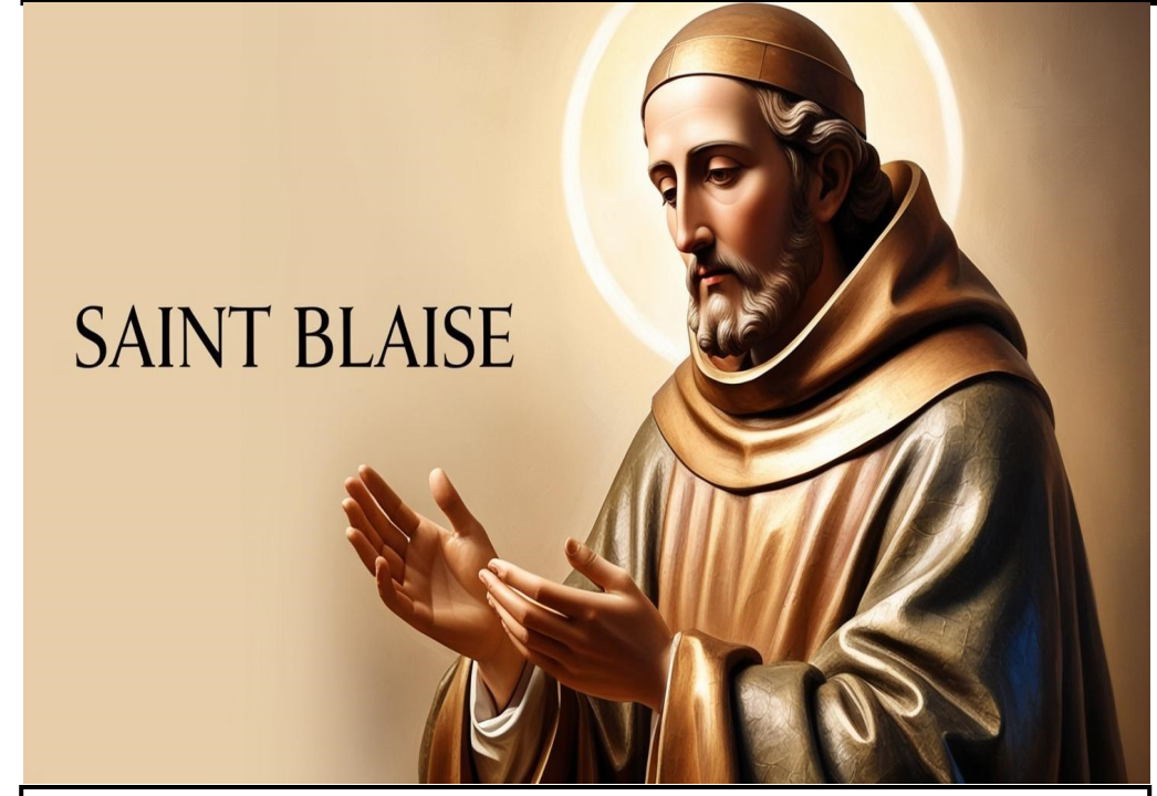
St. Blaise was a bishop and martyr from the 4th century, known for the healing of throats.