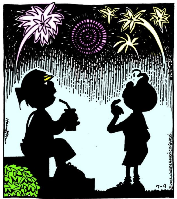
"I'LL BET THE ANGELS AREN'T GETTIN' ANY SLEEP TONIGHT."