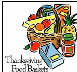
Thanksgiving Food Baskets

Brown bags will be handed out this weekend and next. Please fill food and return to church by the weekend of Nov. 23rd and 24th. Your contributions will help provide many needy homes with a Thanksgiving meal this year.