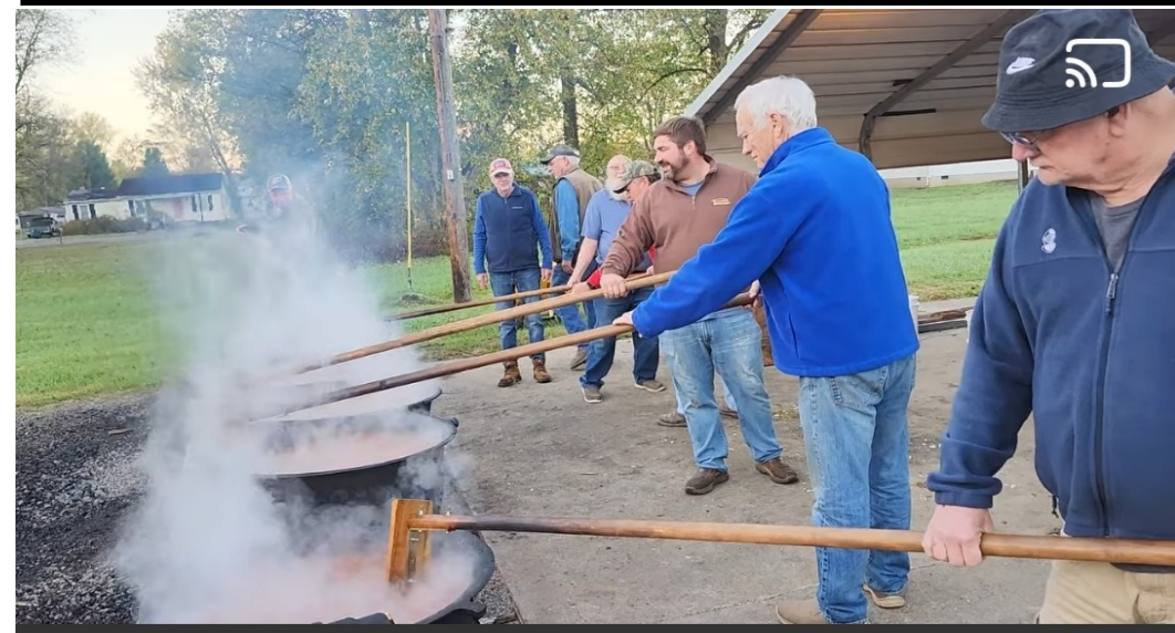
A big Thanks to all who bought burgoo and especially to all those who worked so hard preparing it. Your support and effort will benefit our church Community and K of C charities.